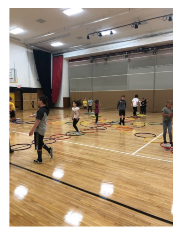
Rock Paper Scissors show-down activity in Phy-Ed.