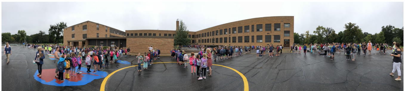
Despite the rainy start to the first day of school, it was a great day for our students and staff!